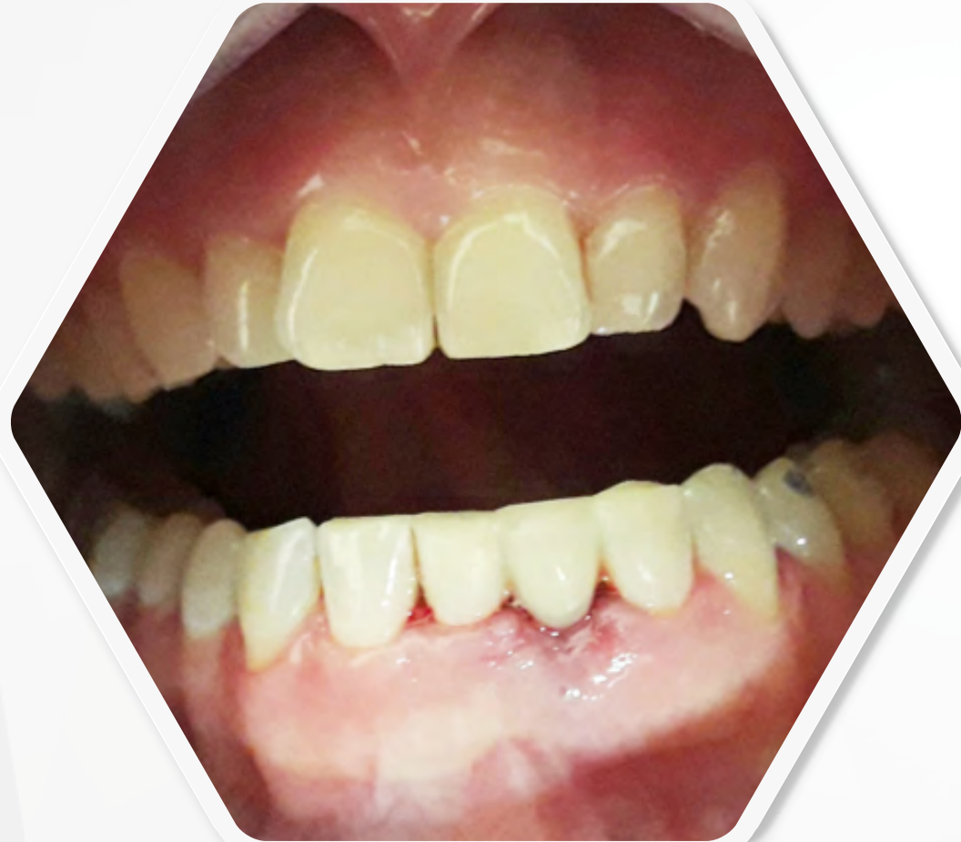
A finished bridge (vestibular view).